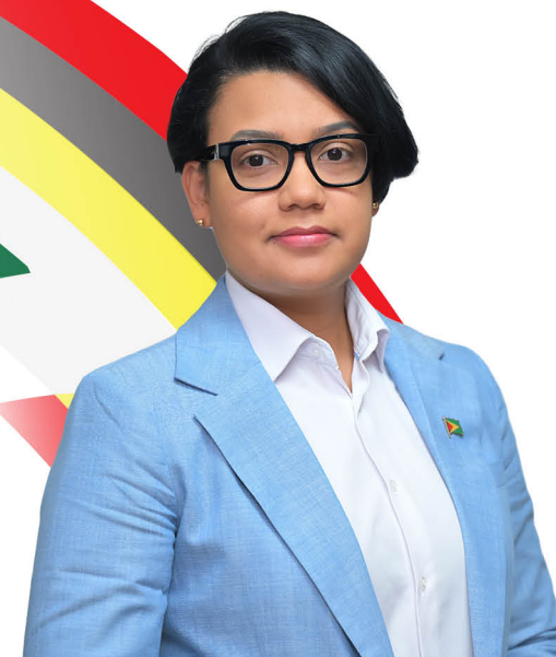
Hon. Collin Croal, M.P., Minister of Housing and Water

So, if you are a contractor, investor, stakeholder, homeowner, or potential homeowner, join us for another adventure in building and construction! You can visit our website @ www.buildingexpo.gy or you can contact the Building Expo Secretariat on 635-1103 or 635-1104. Our friendly and competent team will ensure that you have a memorable experience at this year's Expo! I look forward to seeing and meeting as many of you as I can as we celebrate International Building Expo 2023 — 'Building for all: One Guyana, Many Opportunities'. Thank you!